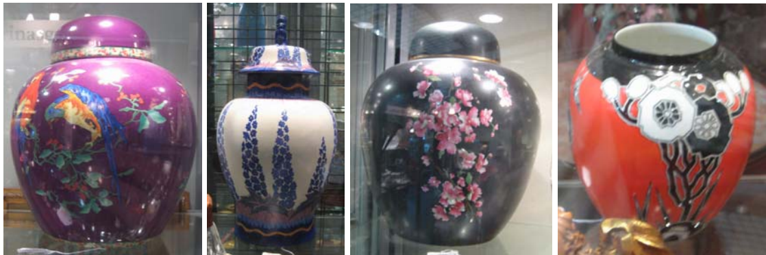
PARROTS 10" ginger jar, pattern 3095, shape 125 DELPHINIUM 14" temple jar, pattern 3273, shape 153 PEACH BLOSSOM 13" ginger jar, pattern 2030, shape 125 Cubist Butterfly 6" ginger jar, pattern 3190, shape 125

The PARROTS ginger jar is in a deep purple colourway; unusual for this pattern. Like us, you may have previously seen this piece, as well as the Cubist Butterfly ginger jar (unfortunately missing its lid) on eBay. These pieces were all