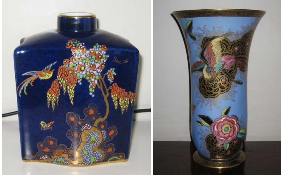
PARADISE BIRD & TREE tea caddy, pattern 3155 NEW CHINESE BIRD & CLOUD 11" vase, pattern 3320, shape 441

On December 10, we left Calgary for our usual winter away from ice and snow. This year we flew down to Argentina and we will be staying in Buenos Aires until late April. In our next Newsletter, we will tell you all about this wonderful city. But briefly, here is a look at a couple of pieces we have already purchased, plus some (not particularly good) pictures of pieces we have seen in shop cabinets.