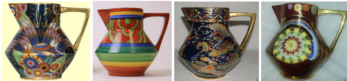
FLORAL COMETS (3422); Flower Medley (3588); Dragon & Traveler (3656); FLOWER & FALLING LEAF (3949)