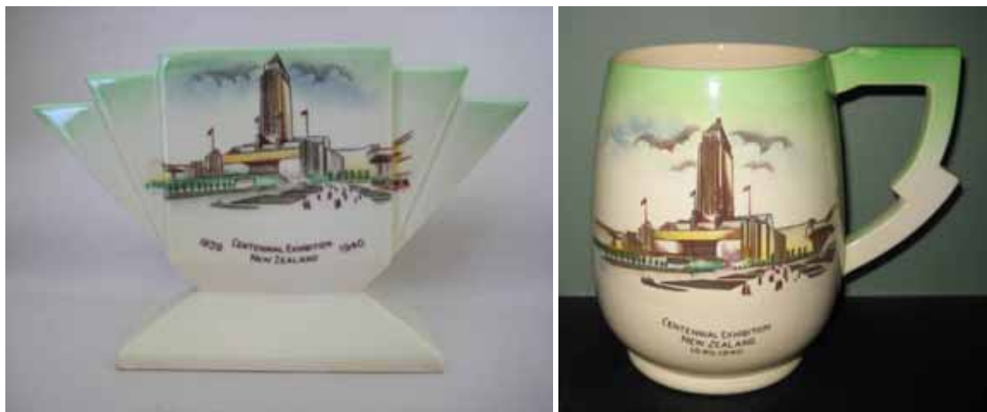
Cigarette or card holder, shape 1210 5" Tankard

On the card holder below, the Exhibition is shown as being held in 1939 and 1940; whereas the tankard shows the period of the Centennial 1840 – 1940. This Exhibition would have been held at the same time as the 1939 – 1940 New York World's Fair and the Golden Gate International Exposition in San Francisco; however, we have never seen Carlton Ware collectables for either of those large exhibitions.