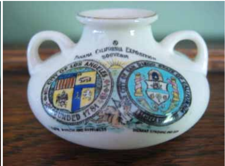
World's Fair California 1915 souvenir vase Panama California Exposition souvenir vase with crests of the City of Los Angeles and the City of San Diego