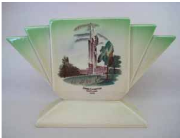
MODERN teapot, shape 1245 Cigarette or card holder, shape 1210