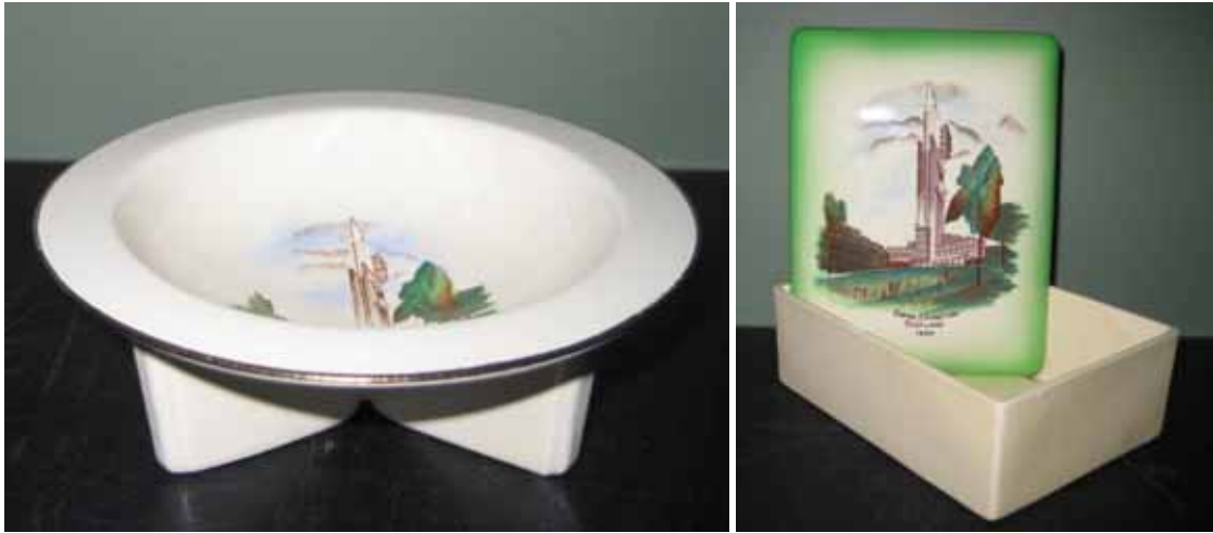
Conical bowl Cigarette box, shape 1398

The simple lines of the cigarette box above showcase Carlton Ware's interpretation of this futuristic building.