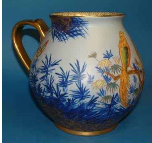
2794 BIRDS ON BOUGH