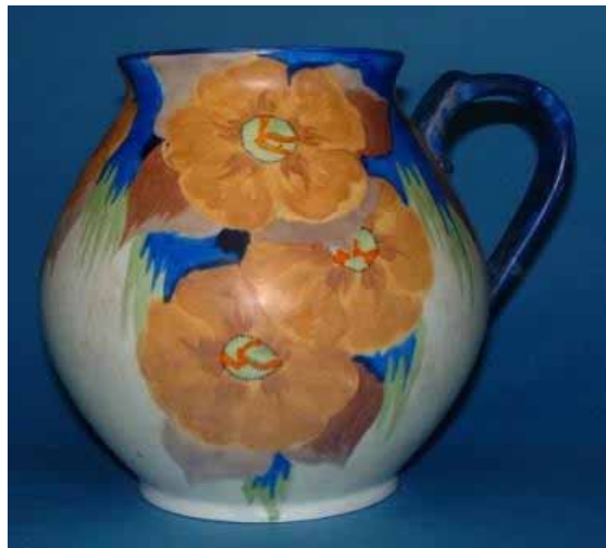
3448 Peach Melba