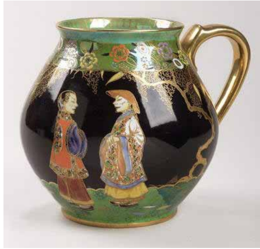
3654 Mandarins Chatting