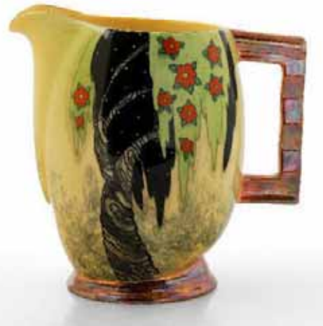
Shape 1347 - MODERN