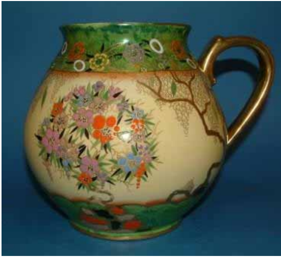
3719 Mandarin Tree