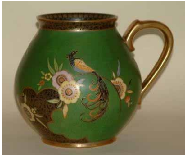
3355 Feathertailed Bird & Flower