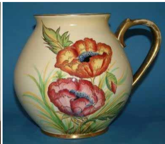
4221 Iceland Poppy