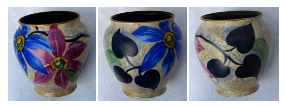
31/4" CLEMATIS pattern vase, pattern 3525, shape 466

In Newsletter #37, Barry & Elaine Girling wrote an article that included a reference to the Handcraft CLEMATIS pattern number 3525 . As they stated, each piece in this pattern, as with most Handcraft patterns, is a virtual "one off". Carol Barnard in Australia kindly sent in a series of pictures showing all sides of a vase in this pattern.