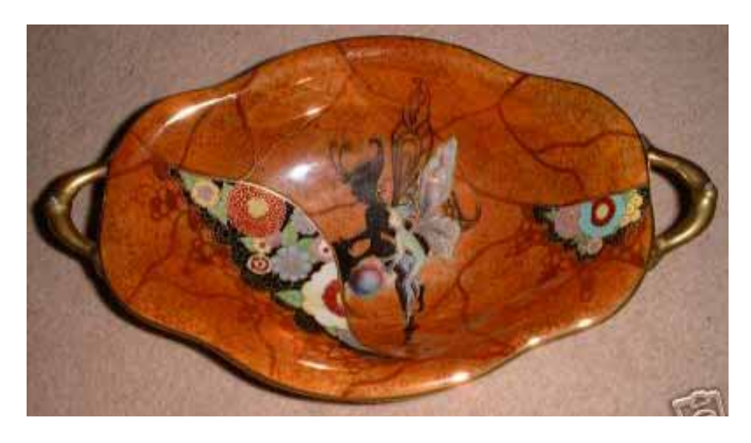
The FAIRY piece above, pattern number 3576 , was listed on eBay earlier this year, the second in this rare pattern to appear in the past 6 months. The pedestal Revo bowl in the beautiful Lustre Orange colourway sold for £1,200.

Carlton Ware used the shadow effect on several other patterns including VICTORIAN LADY (see Newsletter #37) and FAIRY (see Newsletter #36) and no doubt there are others. Did the same person design them all?