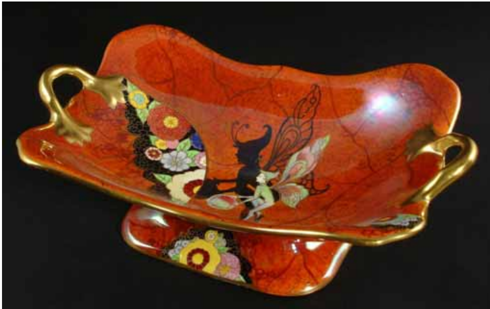
FAIRY 12" pedestal bowl, pattern 3576, lustre orange

This pattern seems to have only been produced in two colourways, the Lustre Blue pattern number 3564 and a Lustre Orange pattern number 3576 . A beautiful example of this colourway was most recently seen at the Woolley & Wallis sale a year ago when the outstanding pedestal bowl pictured below sold for £2,000.