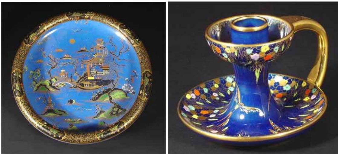
Lot 951: TEMPLE , 12½" floating bowl, pattern 2929 , gloss blue & matt black Lot 952: Fantasia chamberstick, pattern 3421 , gloss powder blue