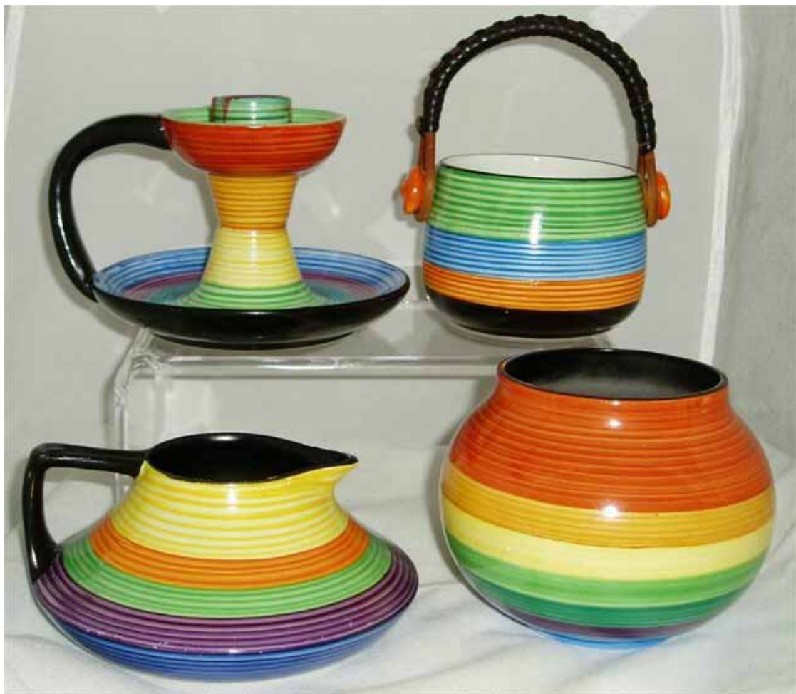
Medley pattern (clockwise from top left) Chamberstick pattern 3587 Pot with wicker handle, pattern 3593 3½" vase, shape 442 , pattern 3587 Jug pattern 3599

"Whilst I had out the photographic tent and tripod, I thought I'd also take a picture of my small collection of Medley pieces - showing variations of this striking, vivid and artfully designed pattern."