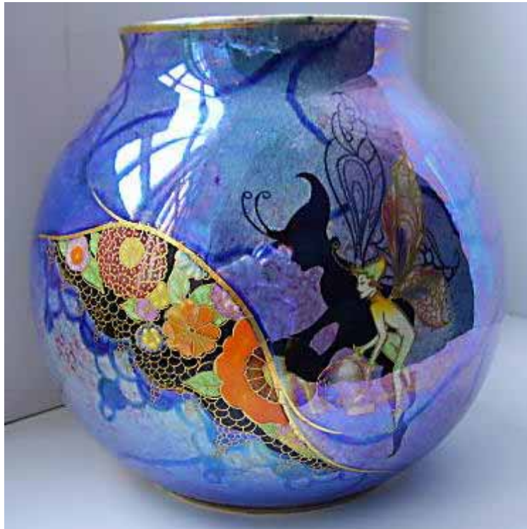
FAIRY 6" vase shape 442 , pattern 3564 , lustre blue

Some wonderful Carlton Ware art deco "Best Ware" patterns were seen on eBay during November, including Bell , Floral Comets and RIVER FISH . There was also a badly damaged piece of Rainbow Fan in the green colourway that garnered several bids even considering its condition. However, perhaps the most spectacular piece to appear was a vase in the elusive FAIRY pattern. The 6" 442 shaped vase was in pattern number 3564 and the vivid lustre blue was stunning. The piece attracted 13 bids and sold to an Australian buyer for £2,210.