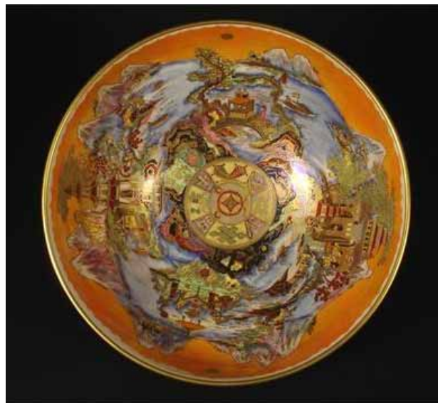
Lot 953: CHINALAND 10" bowl, pattern 2948 , orange lustre