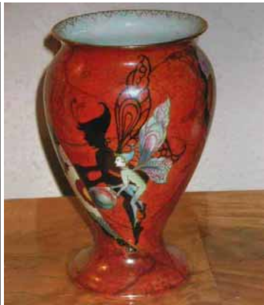
FAIRY 7" ginger jar shape 311, pattern 3564, lustre blue FAIRY 7" vase shape 406, pattern 3576, lustre orange